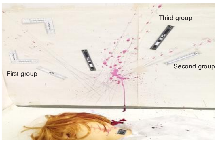
Fig. 1. Three groups of spatters

If we analyze the relation between the impact angles of the first, second and third group of spatters from the analyzed traces shown in Table 4, we will notice that their value decreases proportionally to 17.79, 16.85 and 18.53 degrees, respectively. This is best illustrated in Figure 1, where among other things it can be concluded that if the angle is sharper (smaller), then the blood stains are farther from the source, i.e., the point of convergence and vice versa .